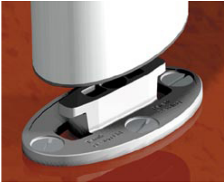
The Post - Connector detail